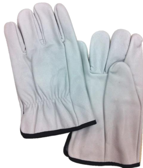
Electrical Glove Protector