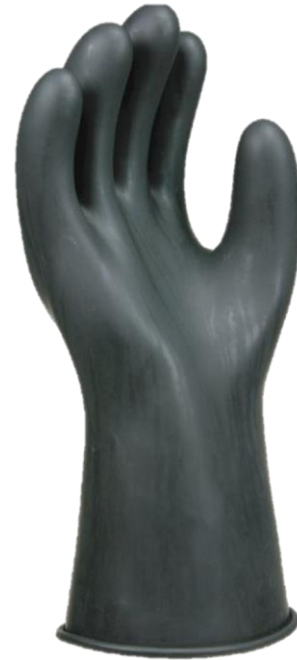
Electrical Gloves, Class 00