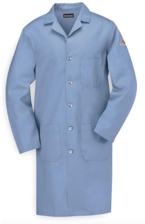
Flame Resistant Lab Coat