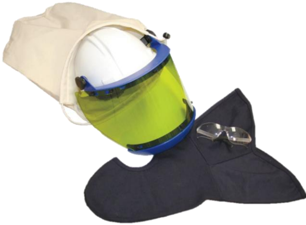
Arc Flash Head Protection Kit